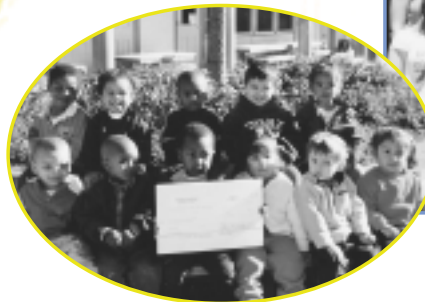
Butterflies Class January 29, 2003