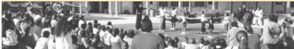
Family Celebrations August 28